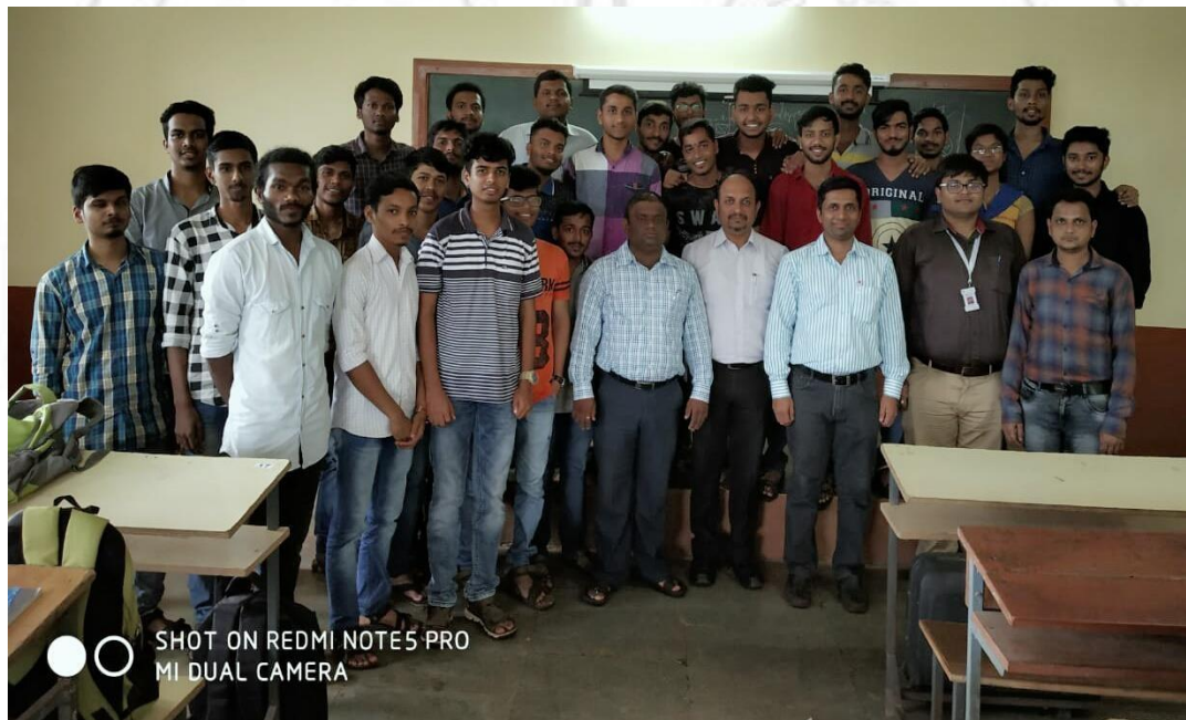
(Group photo after valedictory function)