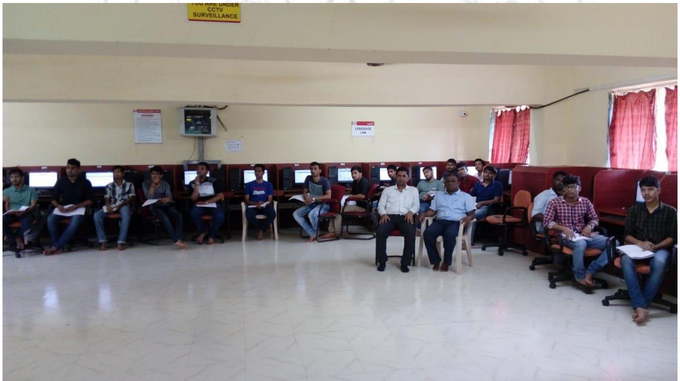
(BE Mech students learning the PLC Programming and SCADA session)

The course has been approved under the Government of India's National Skill Development Corporation (NSDC). The course fees for all 70 students have been completely sponsored by RMCET under its mission to impart technical value-added skills to the students. The students expressed their complete satisfaction about the course contents and appreciated the expertise and